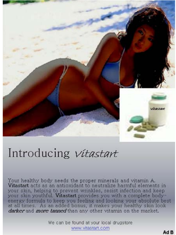
Dark Skin tone Advertisement