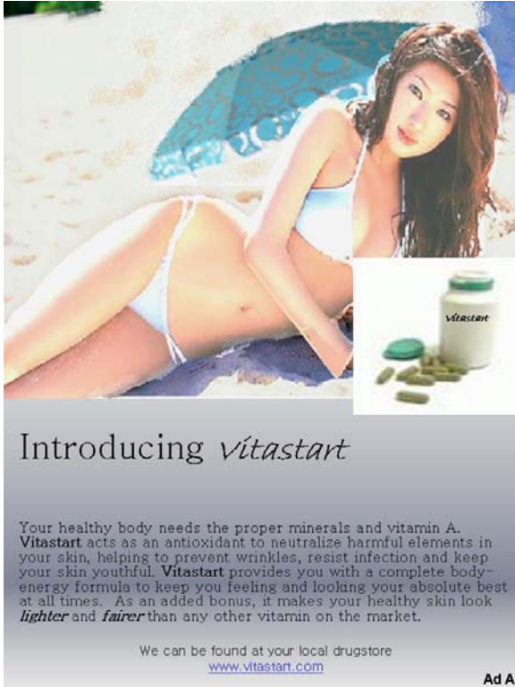
Light Skin tone Advertisement